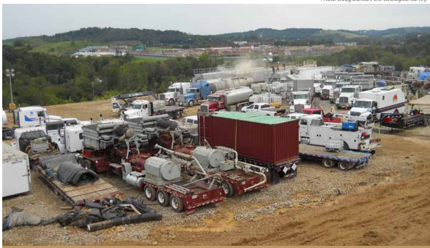
A drill pad in southwestern Pennsylvania during fracking operations.

regulatory regime is capable of fully protecting the public – both due to the inherent risks of fracking and the oil and gas industry's long track record of violating even the most basic environmental, health and safety standards.