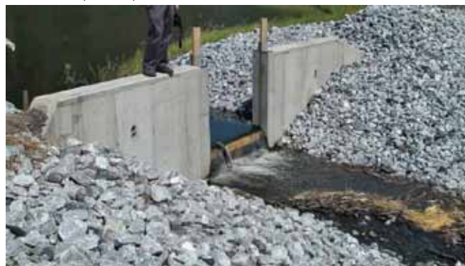
Treated water exiting the Silver Creek acid mine drainage treatment system.